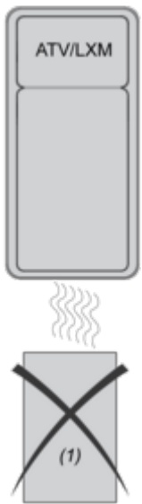
(1) Braking resistor