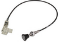
Mechanical remote control