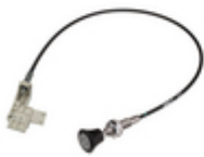
Mechanical remote control